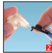
Wax Removal Pick