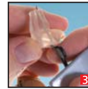
Tube & Vent Cleaner