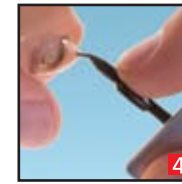
Battery Door Opener