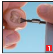
Wax Removal Brush