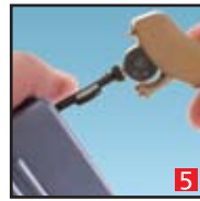
Battery Replacement Magnet