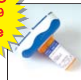
Built-in Rx Vial Opener