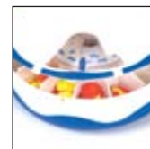
Removable Lid for easy loading