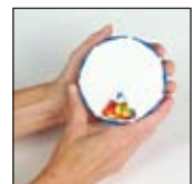
Comfortable Ergonomic Design