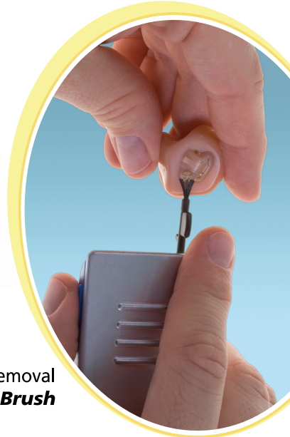
1. Wax Removal Brush