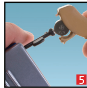
Battery Replacement Magnet