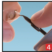
Battery Door Opener