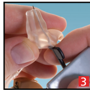
Tube & Vent Cleaner