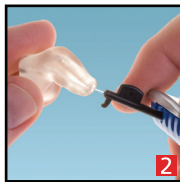
Wax Removal Pick